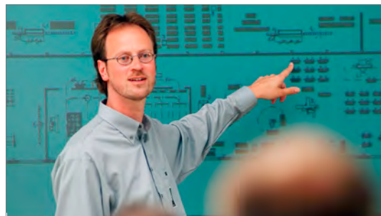
Industry Trend Updates