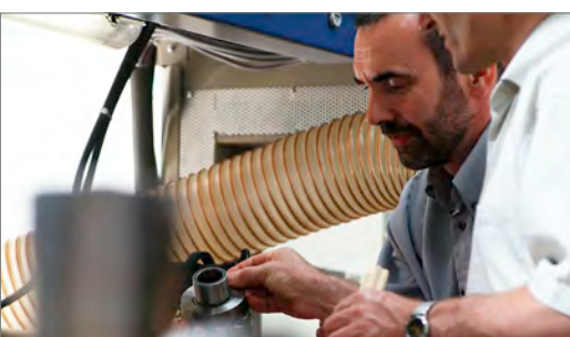
New Products & New Solutions