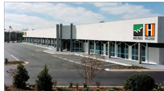
25,000 sq. ft of Technology in ACTION